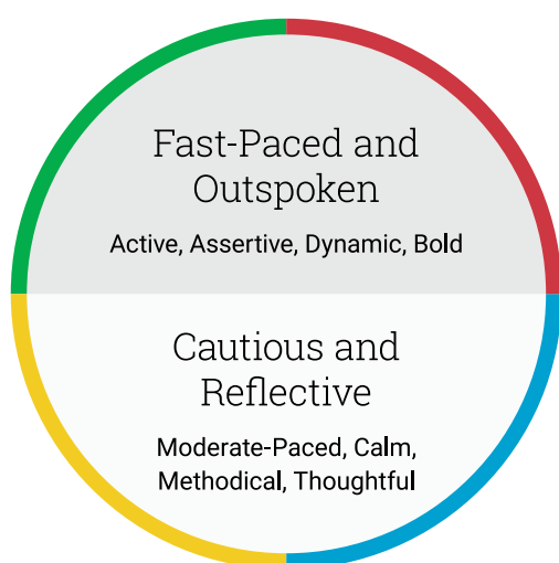
VERTICAL DIMENSION: CAUTIOUS-BOLD